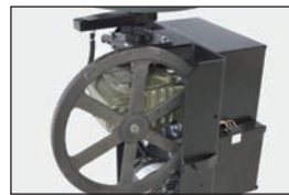
steel frame belt driven