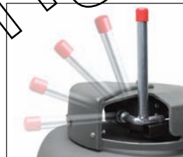
simple manual release